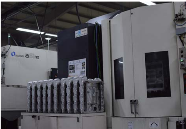
H-MCT: MAKINO, Washing M/C, Leak Test M/C, Tool Presetter