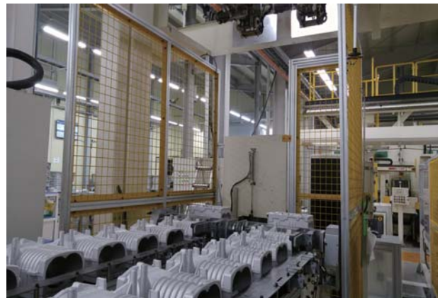
Automated Machining System / Automated SPC System